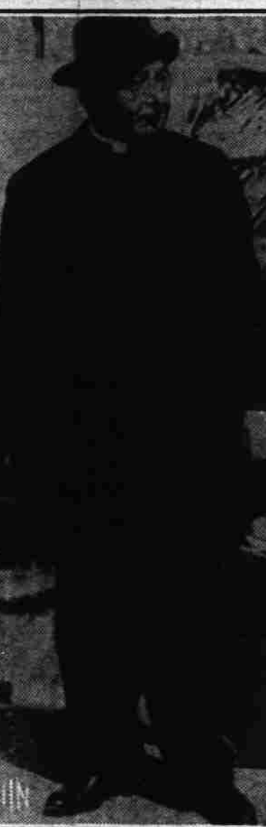
George Cardinal Mundelein

George Cardinal Mundelein, Archbishop of Chicago, waits beside his baggage as he prepares to leave United States for Vatican City. Vacationing in Miami when Pope Pius died, Cardinal Mundelein left immediately to participate in selection of new Pope.