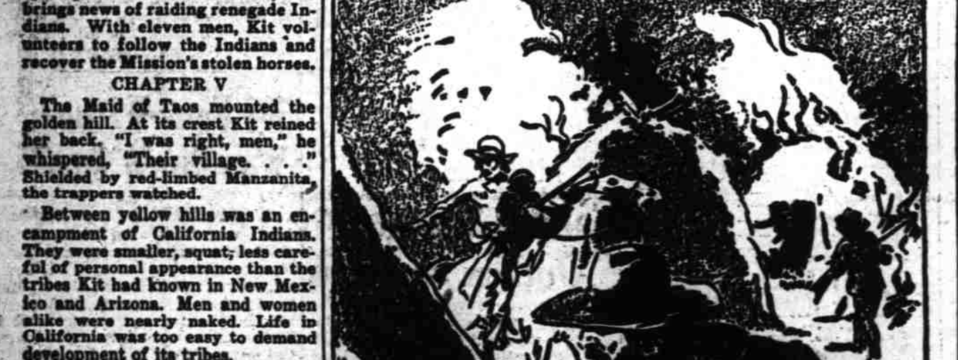
Kit caught up the Chief's son and shouted orders to the trappers who were firing the Indian village.

Her blazing eyes cursed him. White men meant death to her race. Washoe, Yuma, Maidu—their tribes would all vanish from California before Kit Carson visited it again.