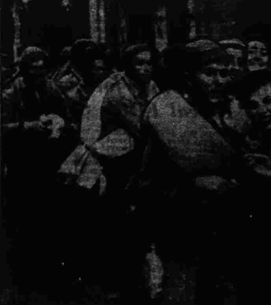
Just as if they were old friends, these young ladies gave the glad hand to the conquering avengers and Moroccans who had the honor to lead the bloodless entry into Barcelona of the insurgent troops under General Juan Yague. The young ladies were glad because the insurgent victory meant food, light and water.