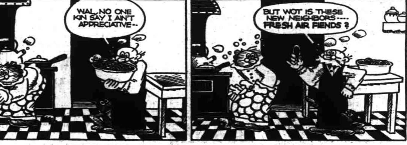
By CLIFF STERRETT