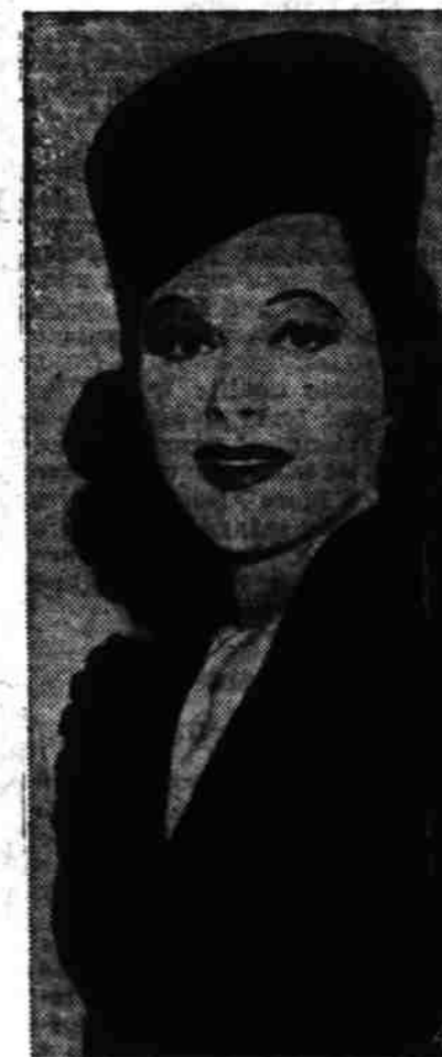
CENSORSHIP trouble in Richmond, Va., cut short the run of "Eccentric" starring Betty Lamm (above), now in Hollywood. Film drew 12,000 persons before it was withdrawn.