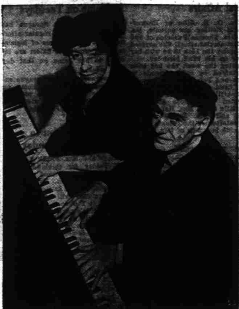
LIFE AFTER 40 years of marriage holds but the pleasantest thoughts for Josef Lhevinne and his wife, Rosina (above), who observed their 40th wedding anniversary by giving a concert in New York and playing many of the piano duets for which they're famous. The Lhevinnes first met at the Moscow conservatory of children and later won its highest musical honors.