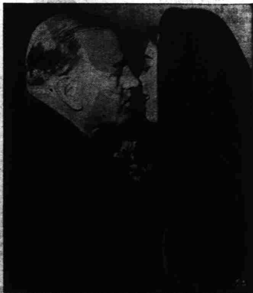
A POLITICIAN'S TOUCH was displayed by French Premier Edouard Daladier on his arrival at Bostin, Corsica, during a triumphal tour of French empire outposts. Daladier kissed the Corsican girl, one of three who thus greeted him and presented him a gold watch and some carnations. Corsica is one of the islands mentioned in the Italian colonial demands.