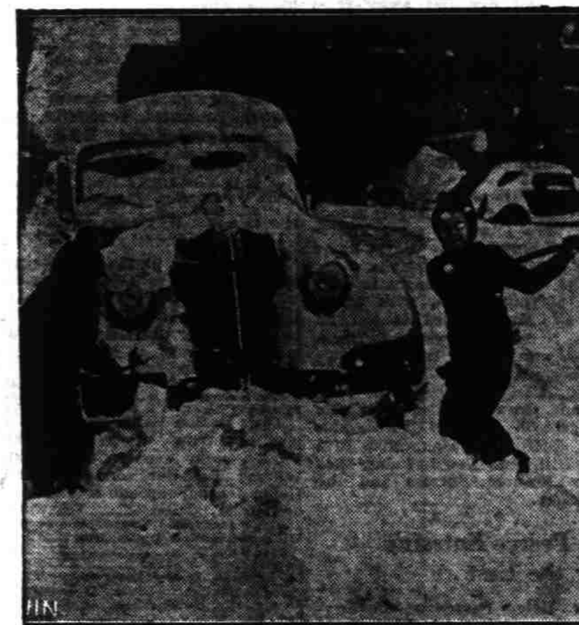
Long Island City children dig out daddy's car