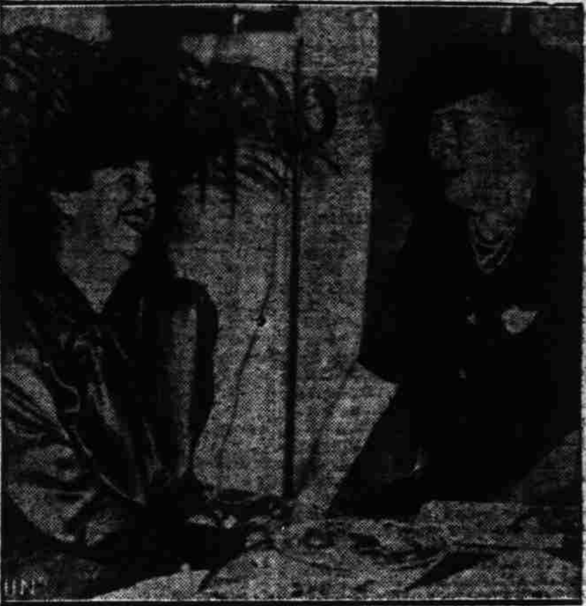
Mrs. Roosevelt and Mrs. Garner Guest of honor at a luncheon given by wives of senate members in Washington, Mrs. Franklin D. Roosevelt, left, wife of the president, smilingly chats with Mrs. John Nance Garner, wife of the Vice president.