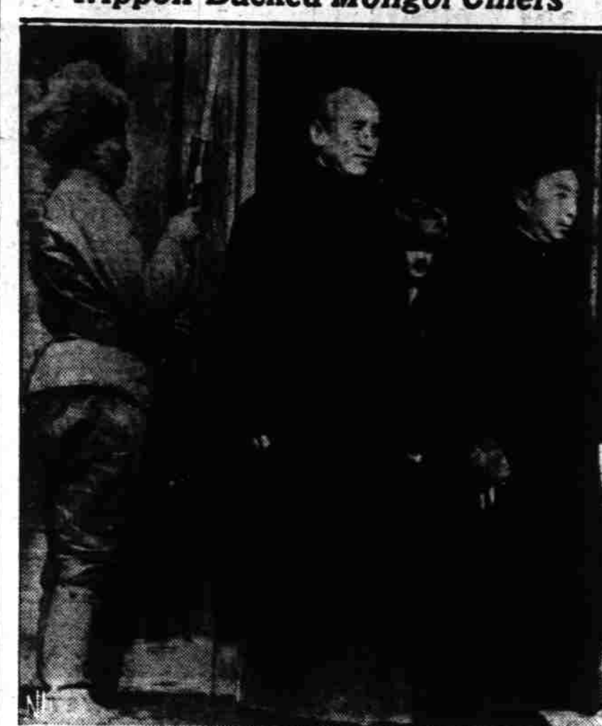
As a sentry presents arms, the chairman of the newly-formed Japanese-sponsored Mongolian government, Prince Tuh Wang (right) and General Li Shou-Hsin, commander-in-chief of the Jap-trained army, pose for their official photographs before the capitol at Hou Ho Go To, Mongolia.