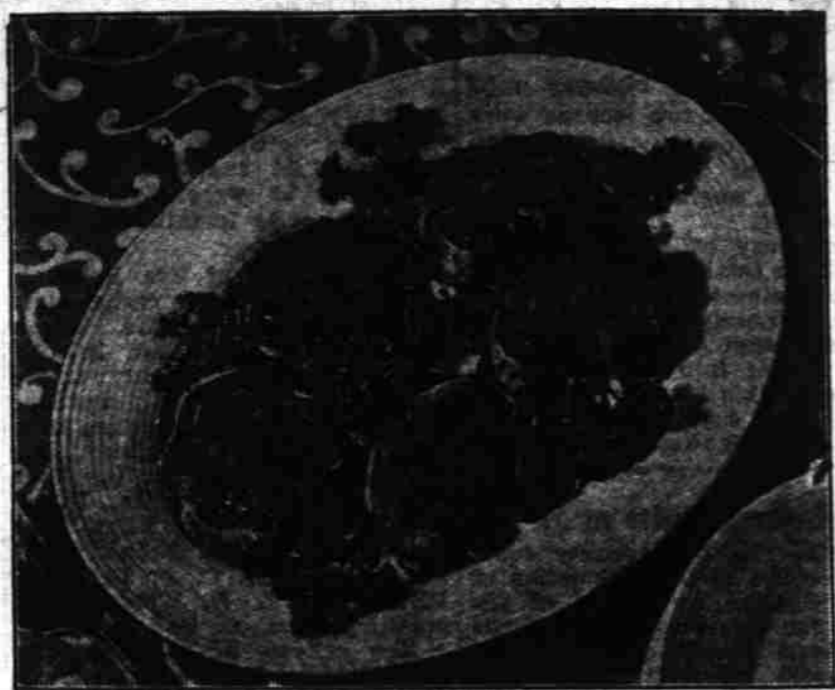
Pork chops served with tomato gravy make a popular combination to serve at dinnertime.