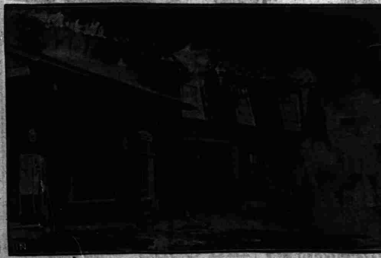
Explosion of a holiday firecracker in a large garage outside the Lynchburg, Va., city limits caused this roaring blast which sent four persons to a hospital with serious burns and caused several thousand dollars damage. The garage and several nearby buildings were destroyed.