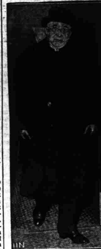
George Cardinal Mundelein of Chicago, makes another of his periodic White House visits in Washington. The Chicago prelate lunched with the president, a personal friend.