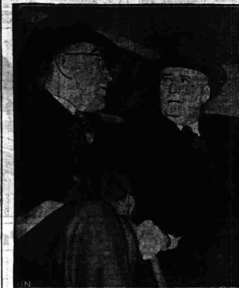
Speaker William B. Bankhead and Representative Sam Rayburn of Alabama, left, and Representative Sam Rayburn of Texas, floor leader, are pictured in earnest conversation in the capital after visiting the White House where the president and his aides mapped plans for the new congress.