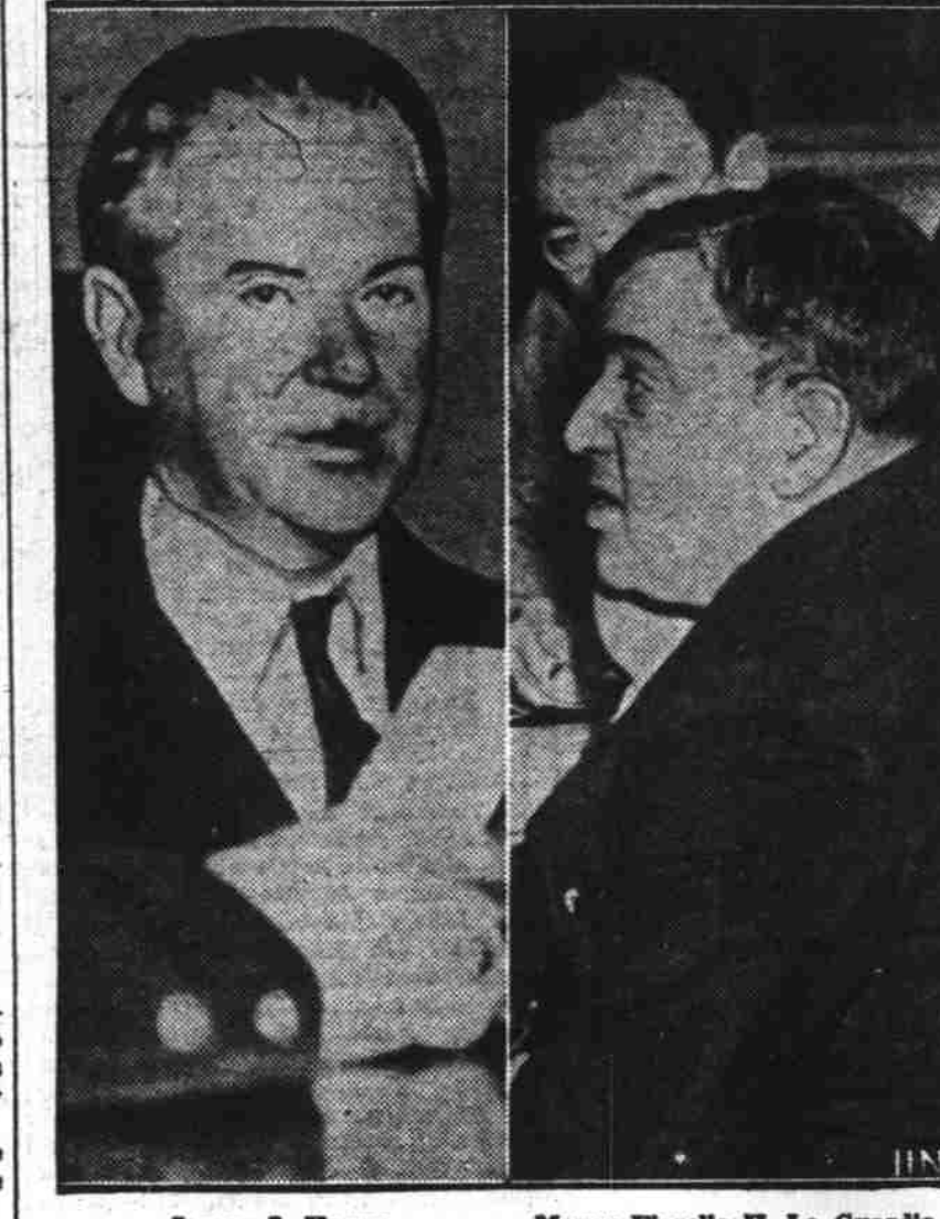
Mayor Fiorello H. La Guardia