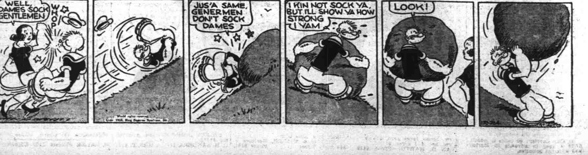
If It Drops It'll Be an Accident"