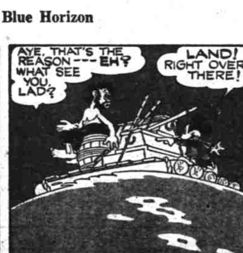
YEH -- IF THE TIDE CARRIES US THAT WAY! IF NOT -- WE'LL GO PAST THE ISLAND!