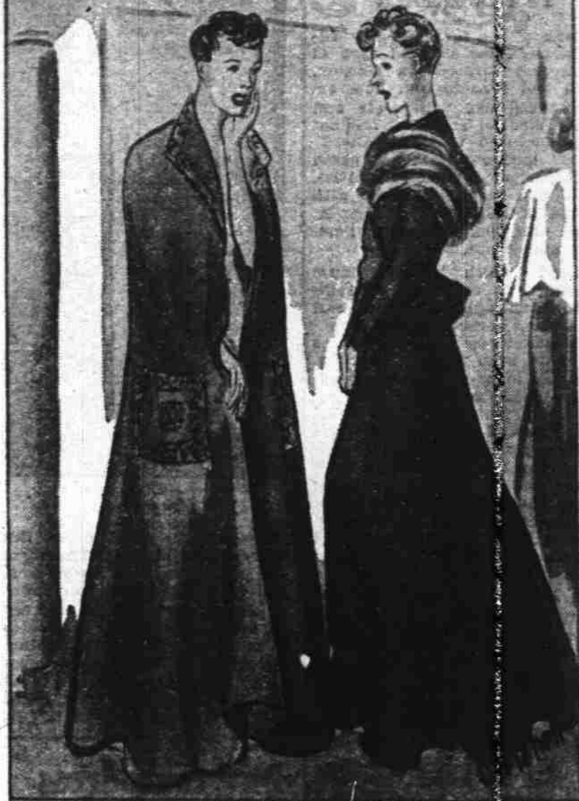
"I just suffered a severe setback. My husband met one of the former suitors I'm always bragging about!"

One of those things you hope won't ever happen, but can only be nonchalant about when it does. And to be gracefully nonchalant, give me an all enveloping, glowingly red evening cape like that above with revers and huge square pockets embroidered in flaming metallic threads. Perky as anything is the stiff little padding on the formal brown suit, right. The skirt's fullness is all concentrated in back and a luscious mink collar falls over the shoulders dipping downward toward the hourglass waistline.