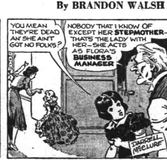
Picking a Sure Winner