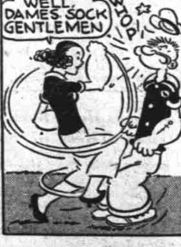
The Dame's Not Acting Like a Lady!