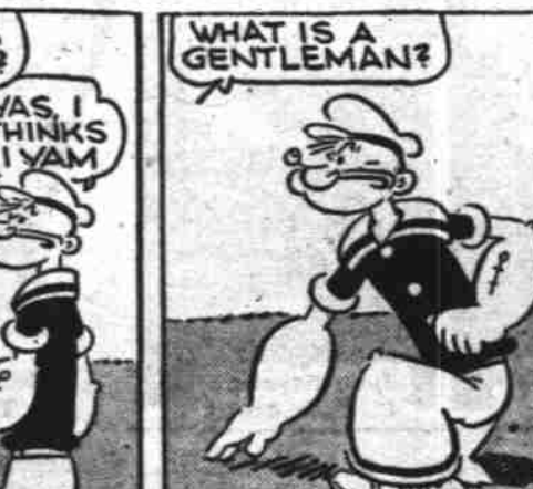
THIMBLE THEATRE-Starring Popeye