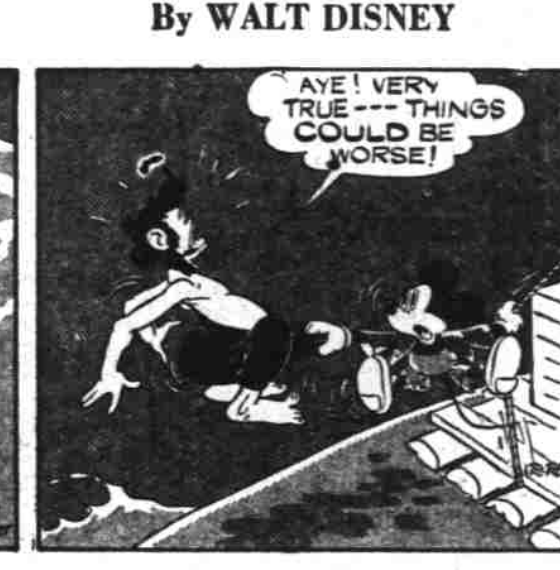
A Pair With Something in Common