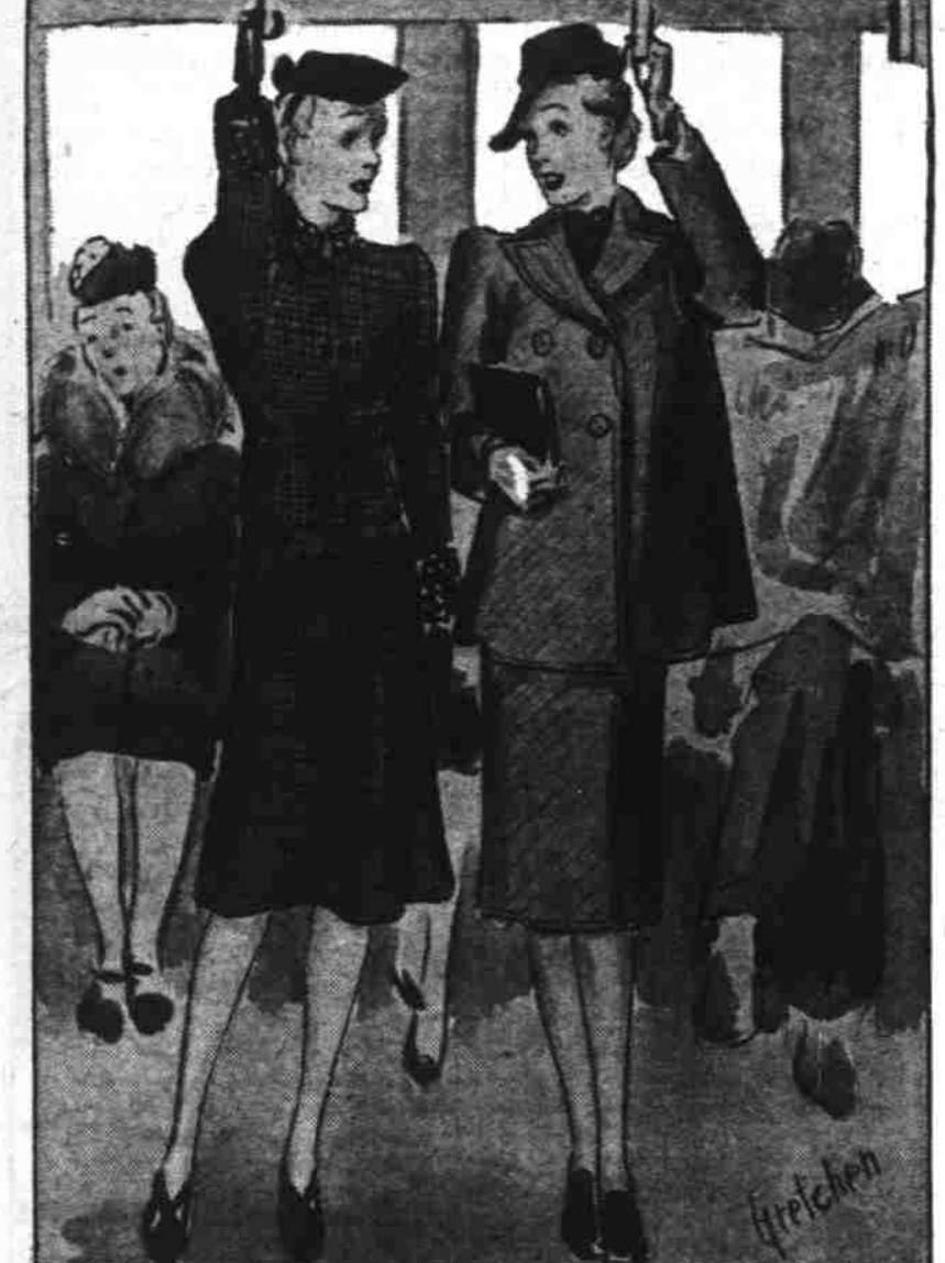
"I do my hardest work before breakfast—getting up!"

Don't we all? This don't we all love to see smartly suited business women—this year more than ever because 1938 fashion and business as well as social life. A guard's red suit, finely overchecked in black, fitted, astrakhan trimmed, would take you as long a way toward this goal as the stubby coated green suit of diagonal tweed swaying gracefully, casually, on the right.—Copyright, 1938, Esquire Features, Inc.