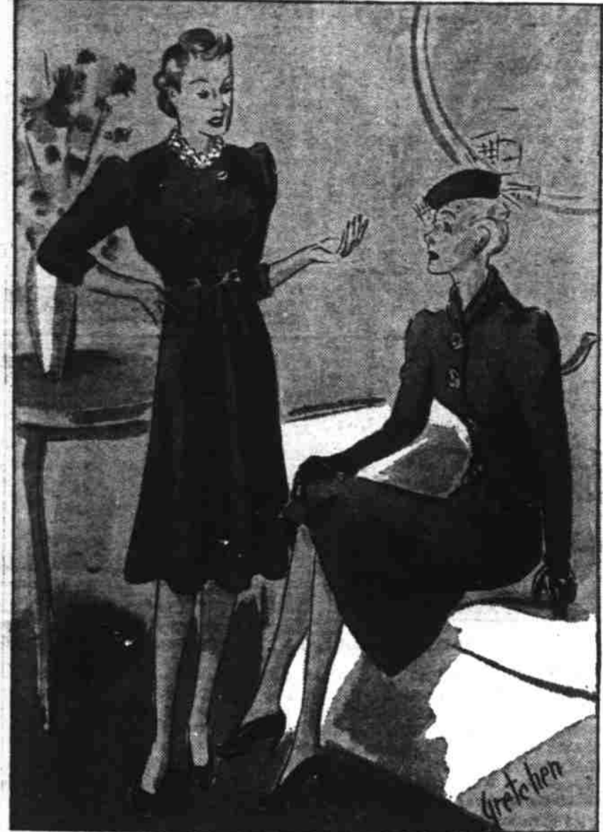
"I believe you that her face is her fortune.—It's always made overnight!"

If your face is gorgeous, whether by birth or by art, attention should be focused on it. Have your dress smart as possible, to be in keeping, but also simple so it serves as background, unornamented save by a necklace that seems to frame that face. The black crepe, left, with its swingy air derived from well calculated fullness, exemplifies this idea. The fitted duvetyne suit votes for simplicity, too, though its large gold buttons are in the modern mood.—Copyright, 1938, Esquire Features, Inc.