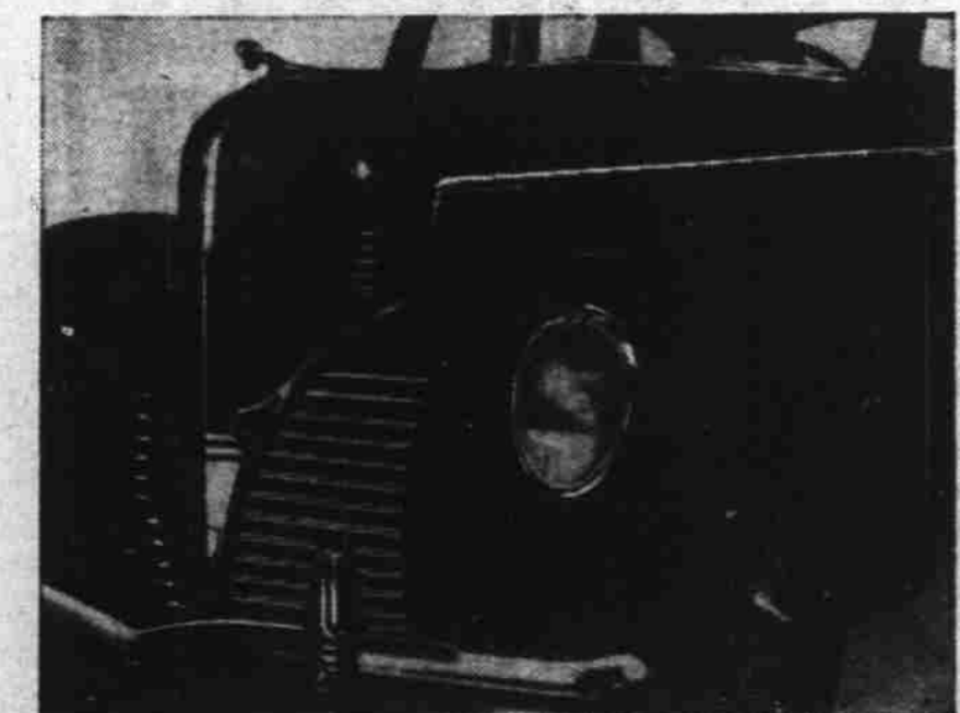
Here is a head-on shot of the 1933 Studebaker State President. Raymond Loewy, designer of airplanes, streamliners and steamships, worked with Studebaker engineers in the production of the model.