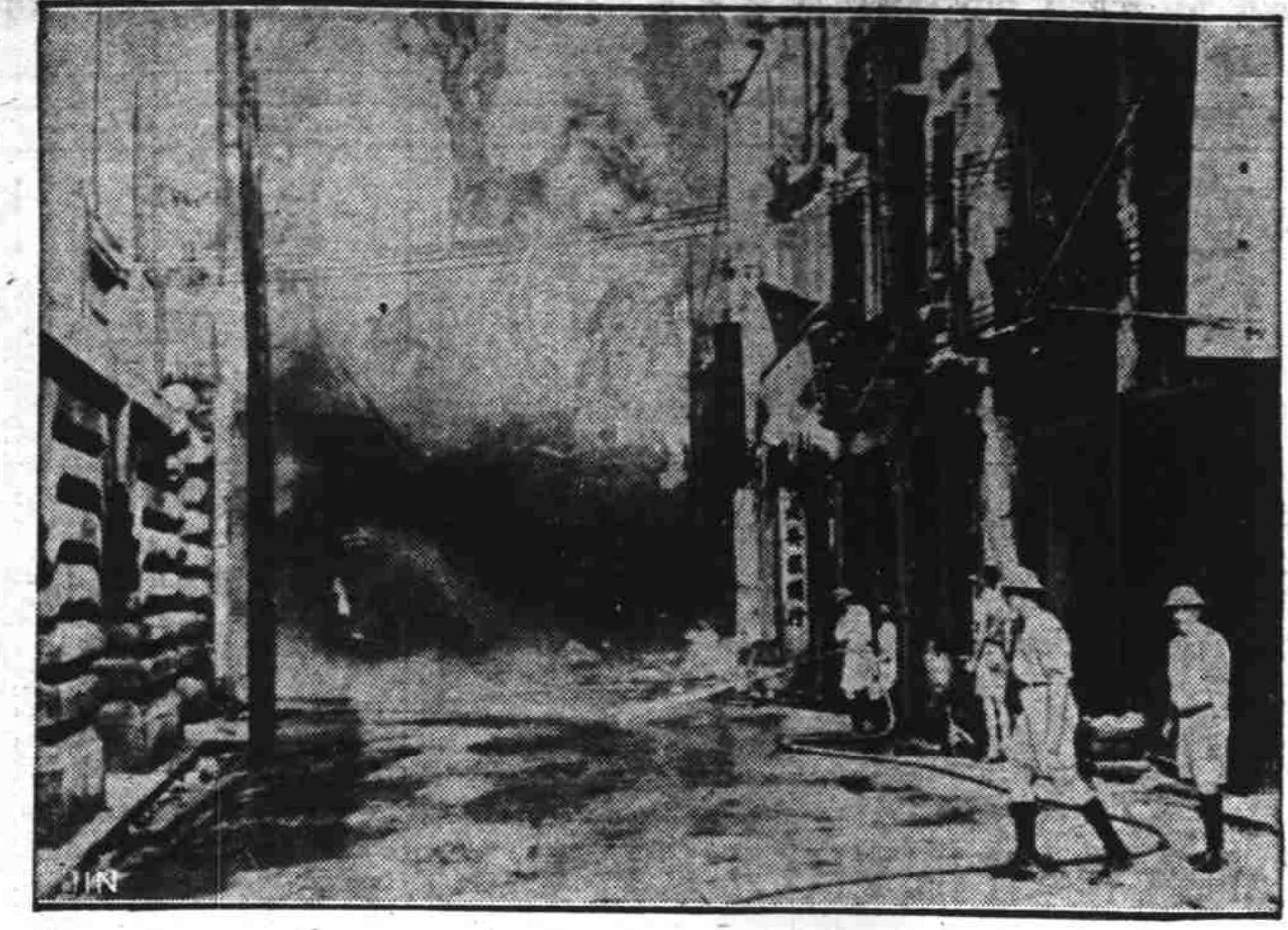
British marines fight fire in Canton

When the Chinese retreated from Canton, China, i ies and power stations. Here you see British maleaving the great South China metropolis to the advancing Japanese, they set fire to many factor-