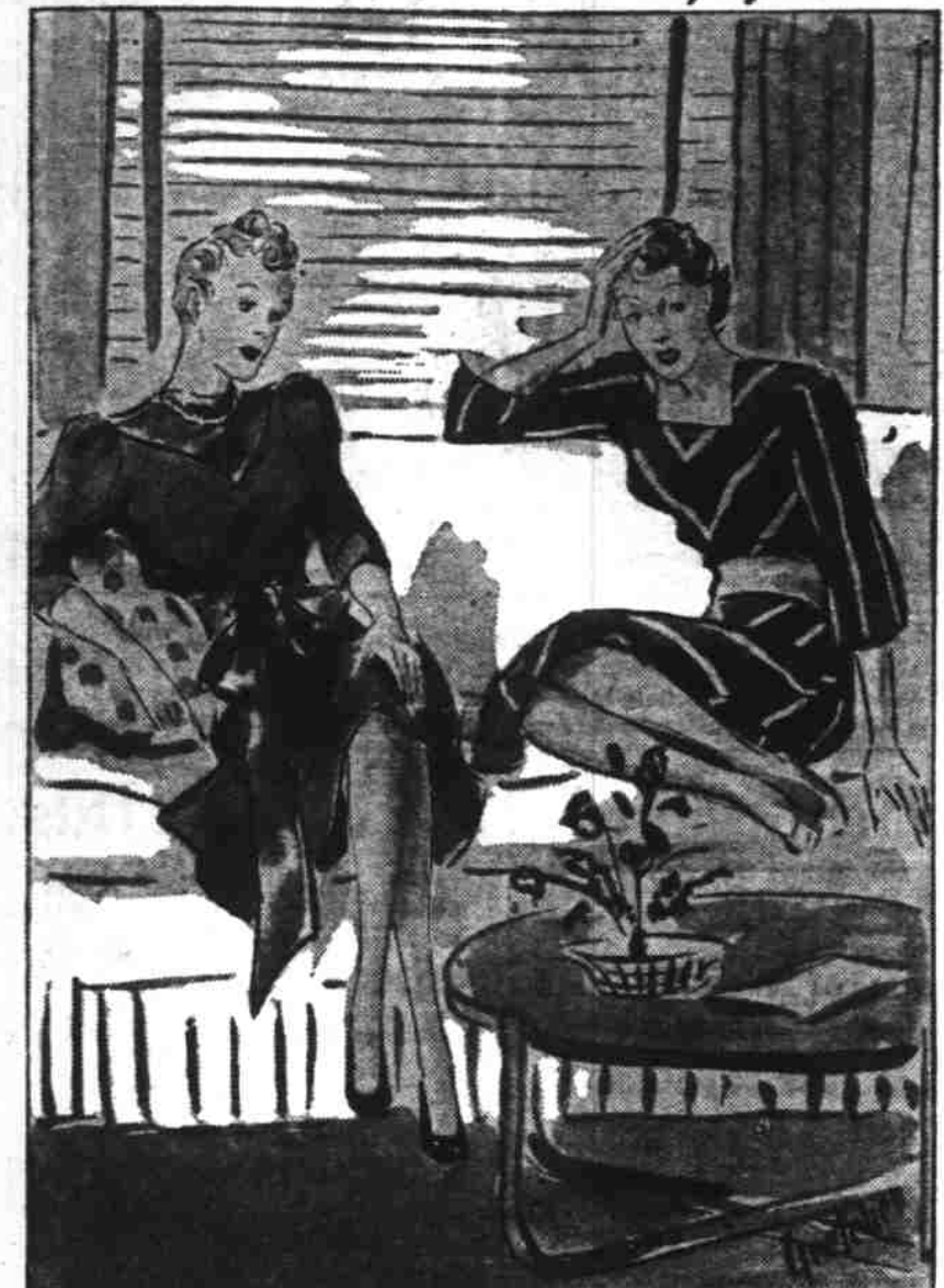
"I can't understand men. They look for home comforts in hotels and hotel service in homes!"

Truer words were never spoken. . . but you can have comfort and service—yes, and the extreme of chic in a date dress using contrasting fabrics as on the left.