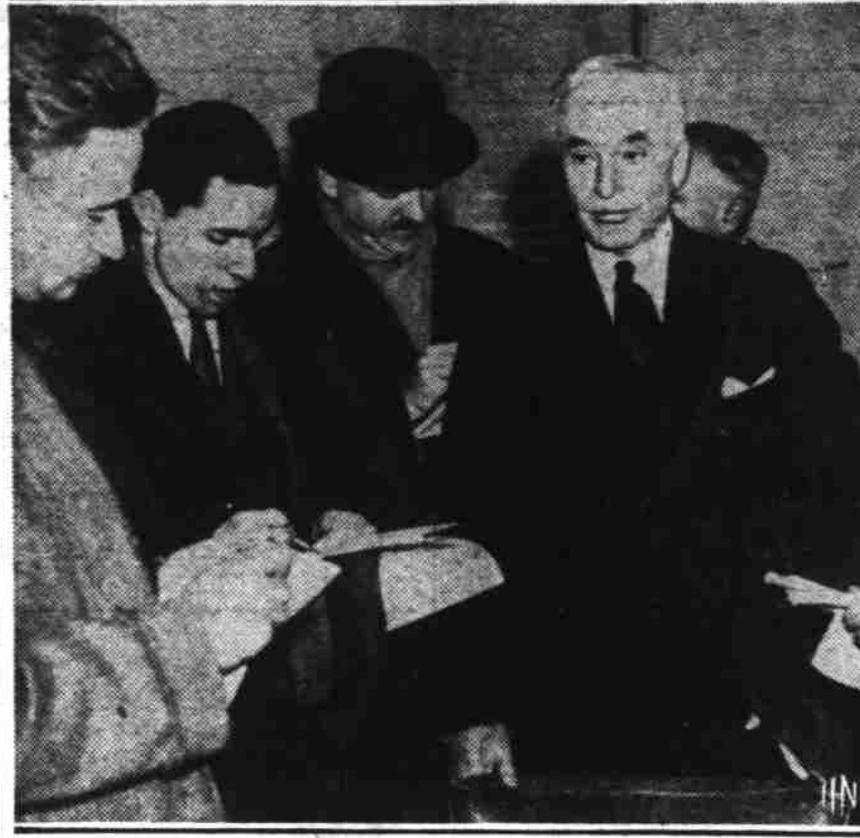
Secretary of State Cordell Hull is interviewed by reporters as he sailed from New York on the Santa Clara for the Pan-American conference at Lima, Peru. Ambassador to Germany Hugh Wilson arrived from Europe in time to have a last minute conference with Hull aboard ship.