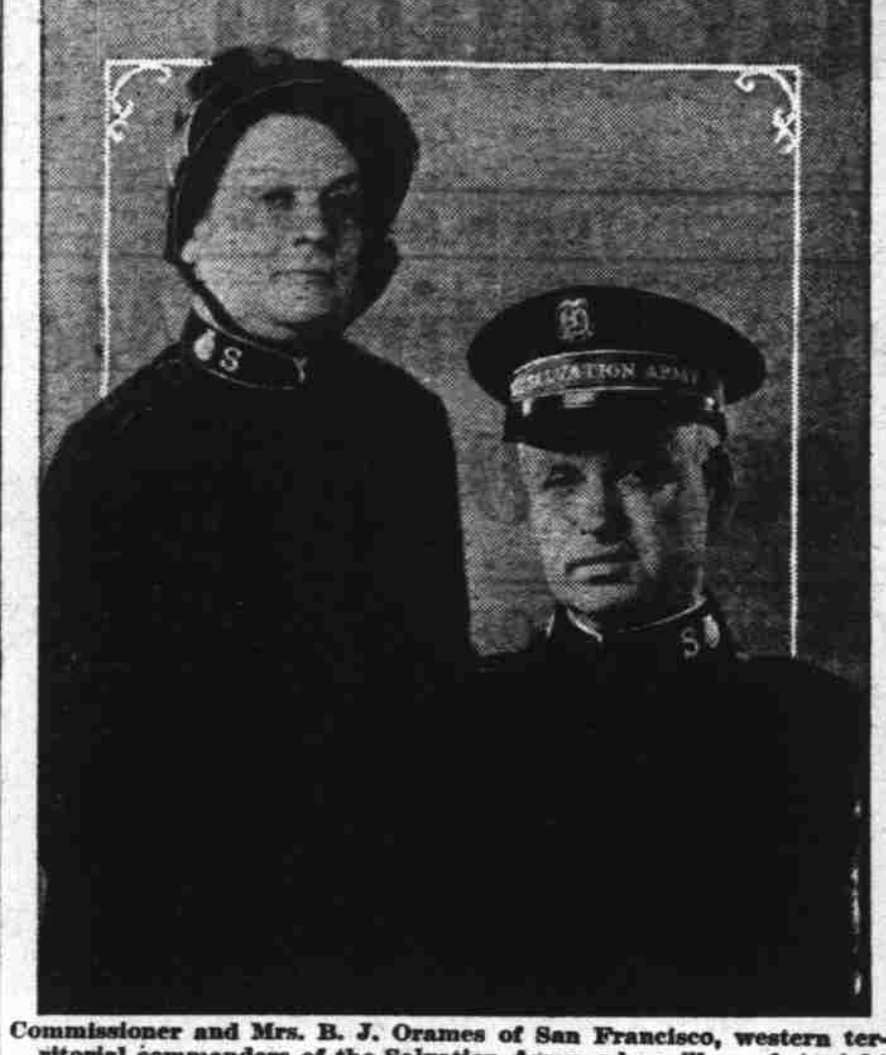
ritorial commanders of the Salvation Army, who will speak tonight and Sunday at services in connection with dedication of the Army Citadel here. Formal dedication rites are tonight at 7:30 o'clock.