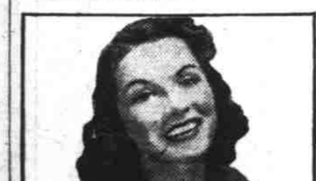
2. You should feel relief very quickly. If pain is unusually severe, repeat according to directions.

To ease a headache with amazing speed, simply follow the easy Bayer Aspirin way shown above. Relief often comes within a few minutes. If this way should fail—see your doctor. He will find the cause and correct it. While there, ask him about taking Bayer Aspirin to relieve headache and rheumatic pains. We believe he will tell you there is no more effective, more dependable way normal persons may use. When you buy, ask for genuine "Bayer Aspirin" by its full name—not for "aspirin" alone.