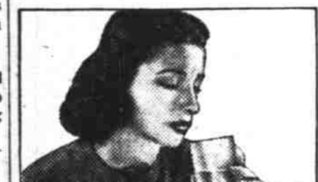
1. Take 2 Bayer Aspirin Tablets with a full glass of water the moment you feel headache coming on.

Simple Method Shown Here Brings Relief in Few Minutes