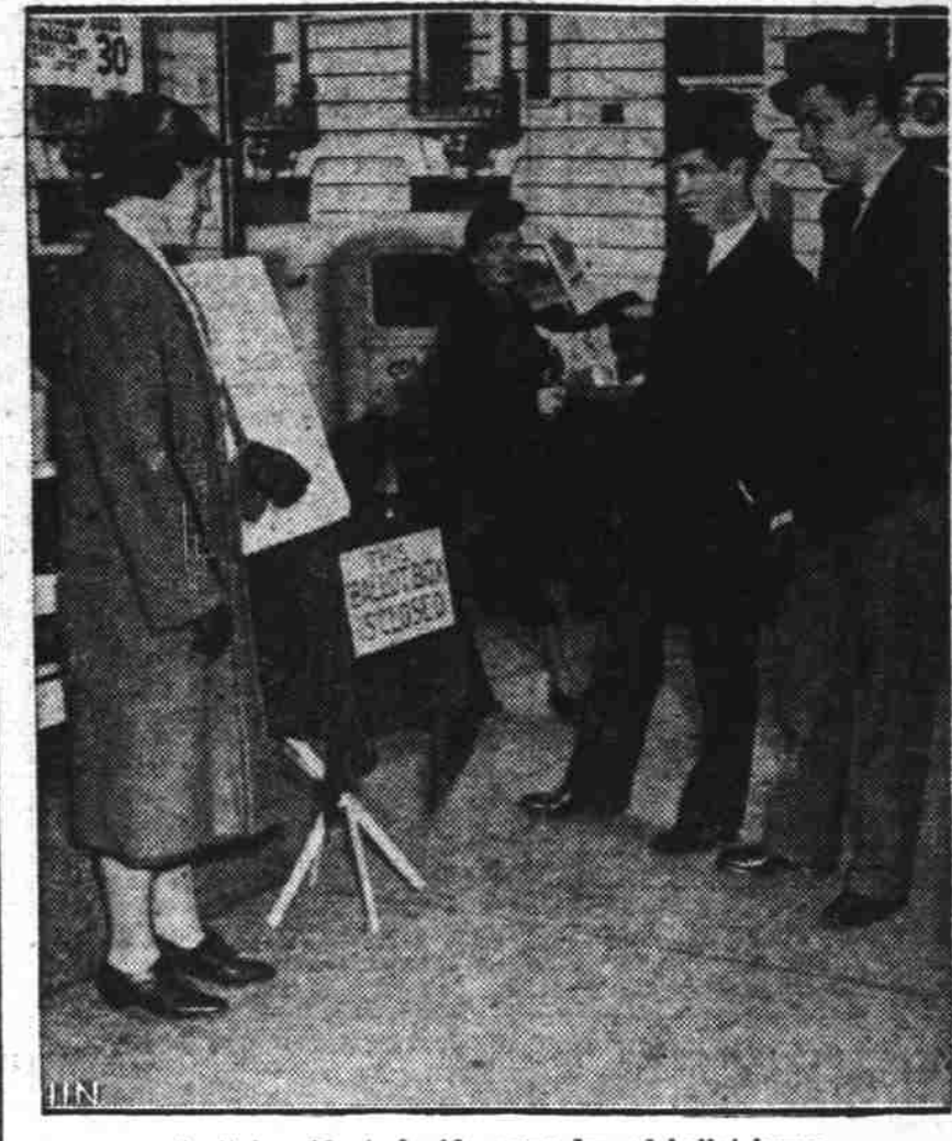
Capital residents beside crepe-draped ballot boxes

While the rest of the United States voted in the Nov. 8 elections, residents in Washington, D. C., the capital of the country, sat by and awaited the outcome. As a protest against not being permitted to vote, crepe-draped ballot boxes were placed on three prominent