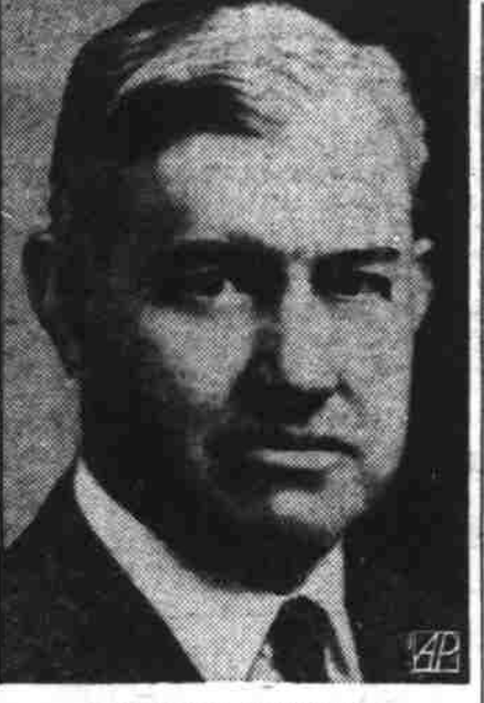
RUFUS C. HOLMAN