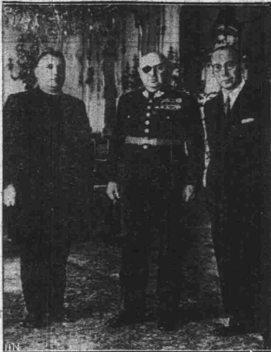
Jozef Tiso, Jan Syrový and Frantisek Chvalkovsky. New Czechoslovakia government heads are pictured. They are, left to right, Jozef Tiso, premier of the newly-formed Slovak government; Premier-General Jan Syrový, and Foreign Minister Frantisek Chvalkovsky.