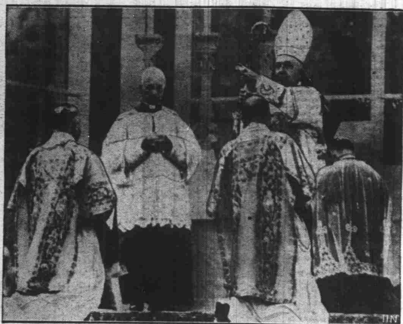
George Cardinal Mundelein gives benediction at New Orleans

Following a solemn pontifical high mass in the City Park stadium in New Orleans, one of the most impressive of all National Eucharistic Congress services, George Cardinal Mundelein, papal delegate, gives his benediction to a huge throng. More than 50,000 persons were in the stadium for the mass.