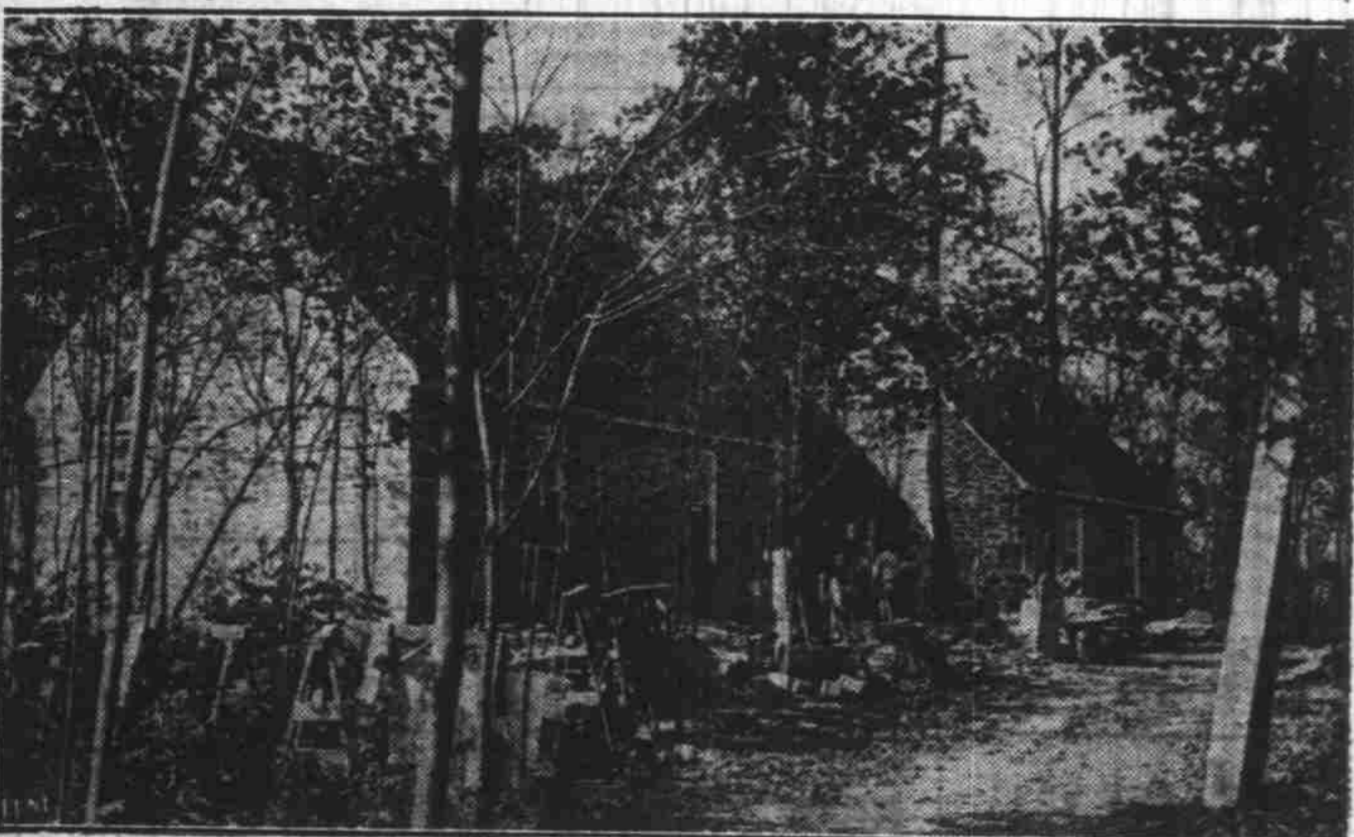
View of the Roosevelt "dream cottage" from a driveway in the rear