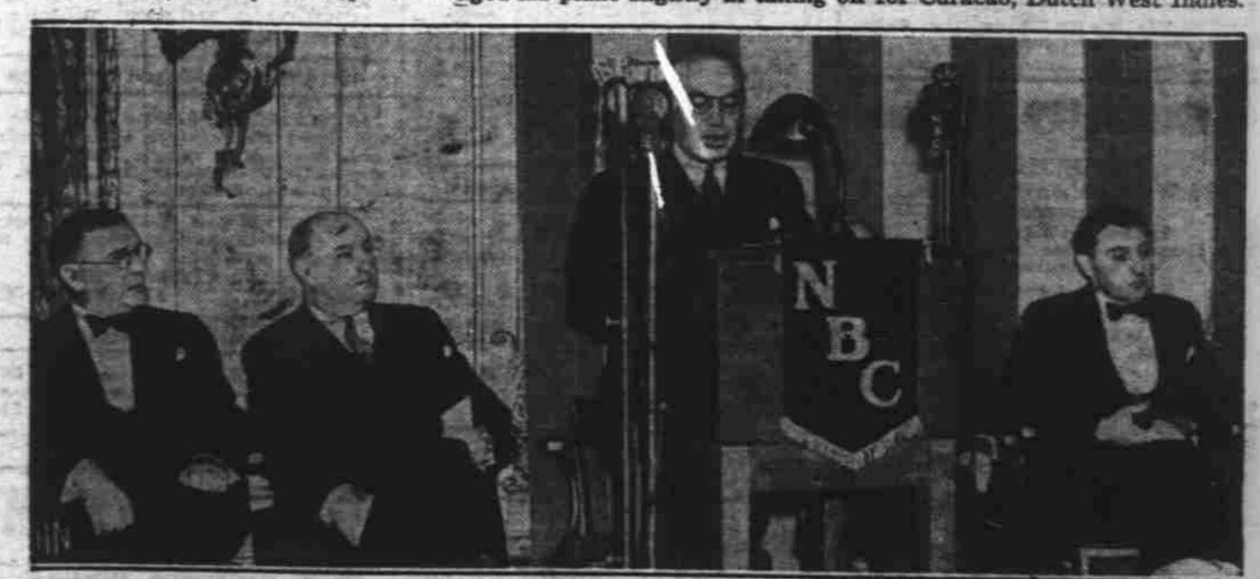
Governor Herbert H. Lehman, of New York, is pictured formally accepting Democratic nomination for governor. Supreme Court Justice Charles Poletti, candidate for Lieut-Governor, is at right. Behind Lehman, paper in hand, is Postmaster-General James Farley, who is also National and State Democratic chairman.