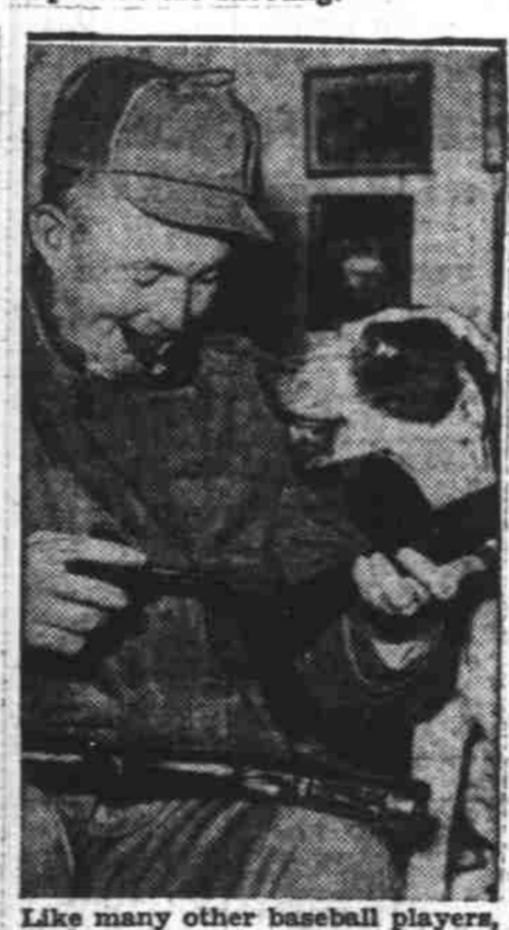
Like many other baseball players, Gabby Hartnett, manager of the Chicago Cubs, goes hunting in the off seasons. Here he is in Chicago with his gun and his dog prior to departing for the northwest.