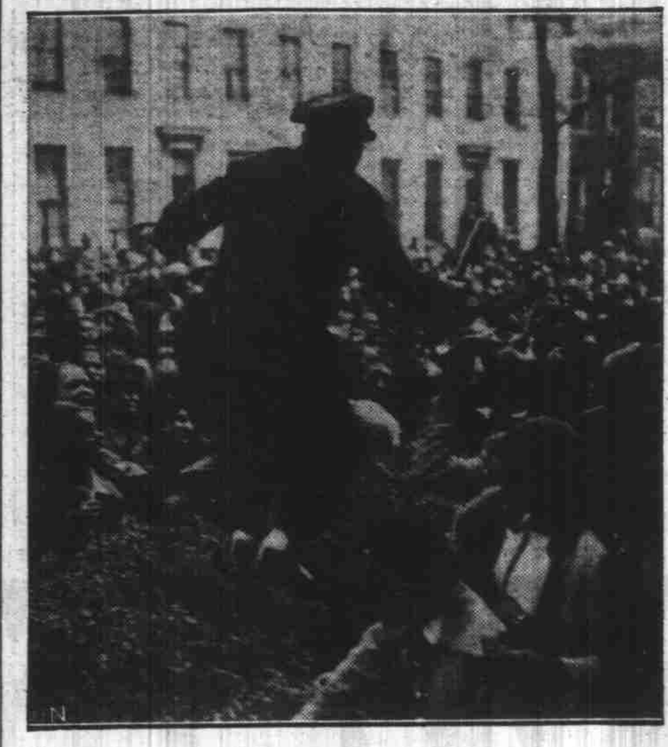
Police attempting to check applicants

When 15,000 persons blocked traffic in Washington in a battle for application blanks for charwomen's jobs in the fourth district, police were called out to maintain order. Only 2,000 applications were available. More than 100 policemen, including this one jumping a hedge fence to hold back the job seekers, had a hard time preventing a riot. The jobs paid $90 a month.