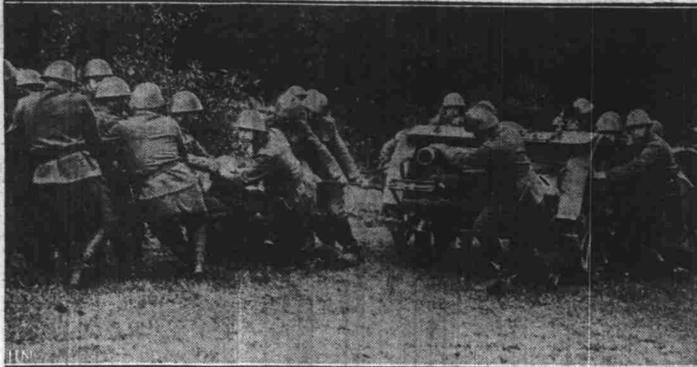
Czechoslovakian artillerymen are shown above hauling a huge field gun from its position, preparatory to evacuating it and other army equipment from the Sudetenland, which the Czechs were forced to cede to Germany by accord of Britain, France, Germany and Italy.