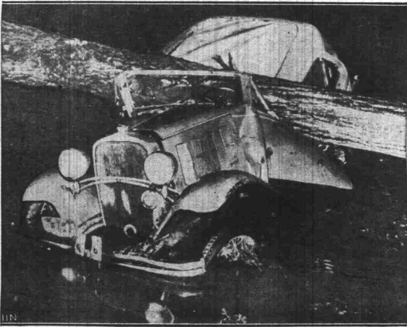
High wind uprooted many trees and light buildings throughout the east and New England. This tree trunk crashed down on an auto near New York City. Rescue workers were kept busy saving marooned families and helping in the evacuation of those in lines of flood-swollen rivers.