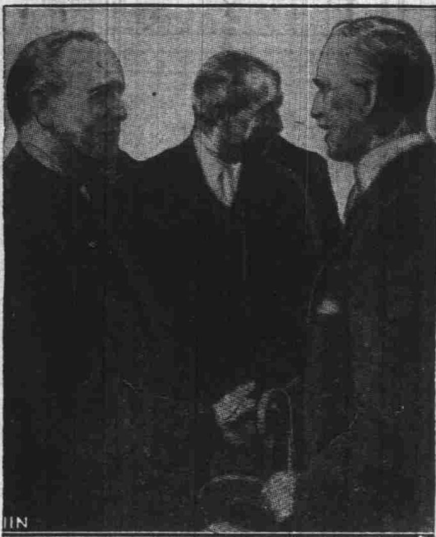
Foreign Minister von Ribbentrop, Sir Neville Henderson, Prime Minister Chamberlain

This historic photo, sent by radio across the Atlantic, shows Prime Minister Neville Chamberlain, right, as he was greeted by Joachim von Ribbentrop, German foreign minister, on arriving at Munich, Germany, after flying from London. Sir Neville Henderson, British ambassador to Germany, is in the center. Chamberlain returned to London to confer with the British cabinet following his conference with Hitler at Berchtesgaden, a parley at which the Reichsfuehrer was believed to have stood firm on his demand for autonomy for the Sudeten Germans.