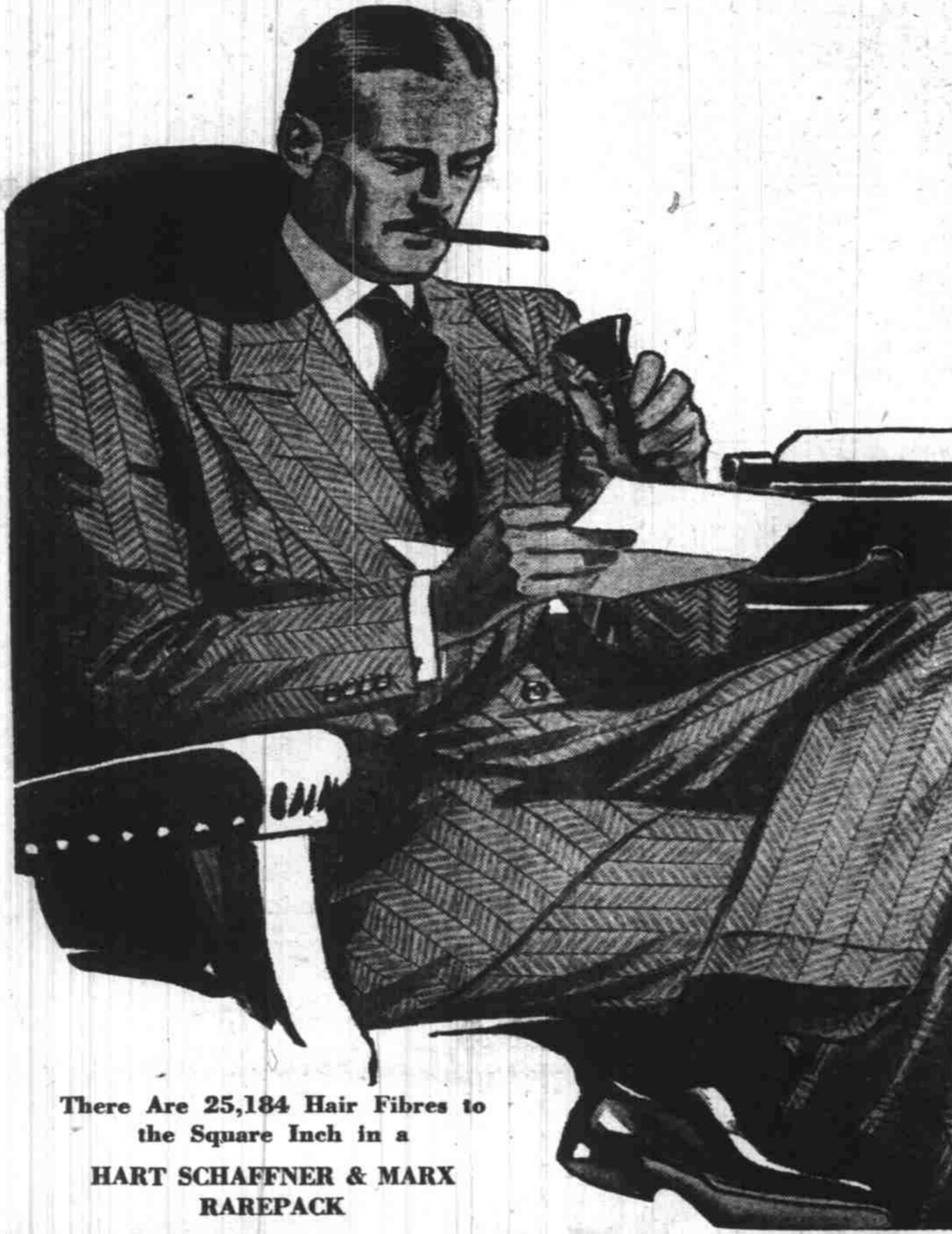
There Are 25,184 Hair Fibres to the Square Inch in a HART SCHAFFNER & MARX RAREPACK