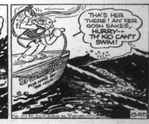
Am I Listening?