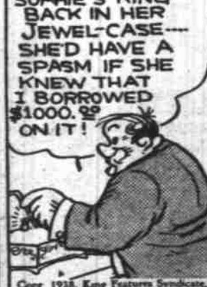
THERE, I'LL PUT SOPHIE'S RING BACK IN HER