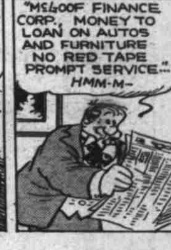
HELLO! MEGOOF FINANCE CORPORATION? RUSH PLEASE HURRY!