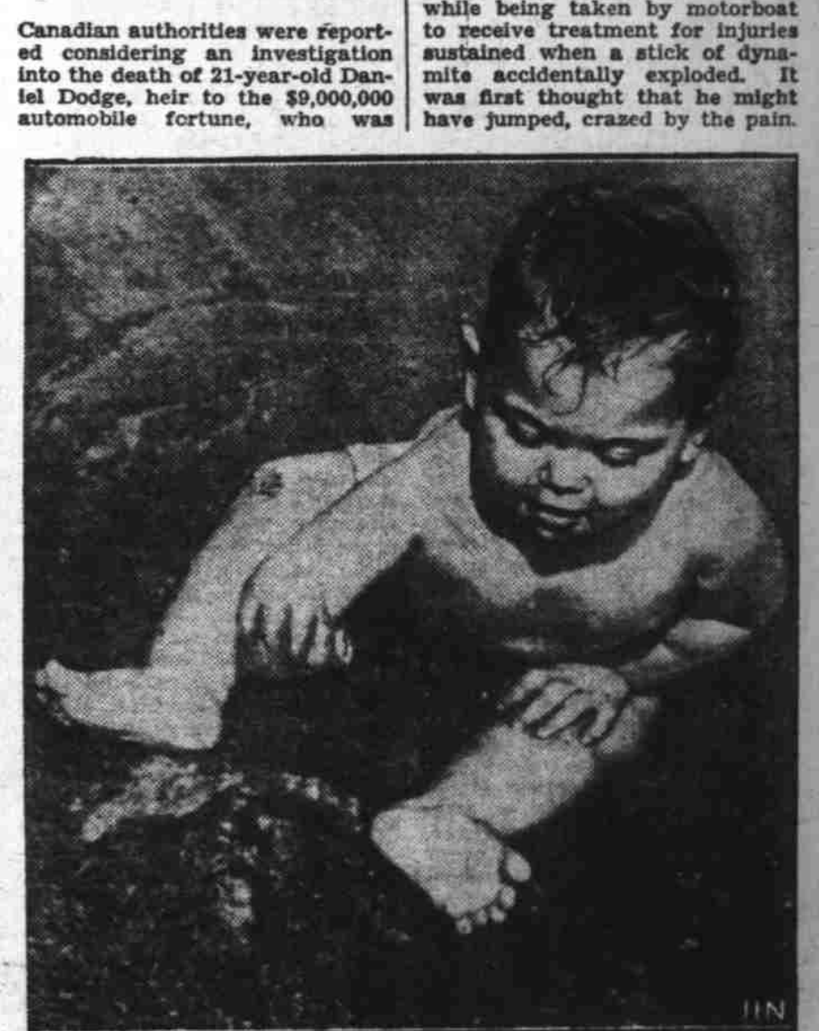
Phoocy on cameraman's birdie! So engrossed was this little fellow in the business of keeping cool and completing his mud pie, that he didn't even look up when the cameraman snapped his picture as an example of the way one tiny New Yorker kept cool.