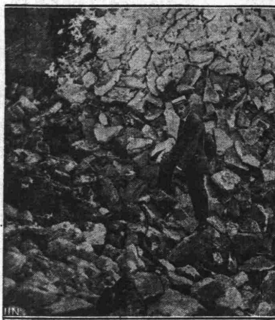
Detective points to where bodies were found Total of murders attributed to a crazed "torso killer" in Cleveland was raised to 13 in the past three years when the decomposed bodies of two more victims were found buried in a rock-filled dump near the shore of Lake Erie. In all 13 cases, the victims had been dismembered and several decapitated.