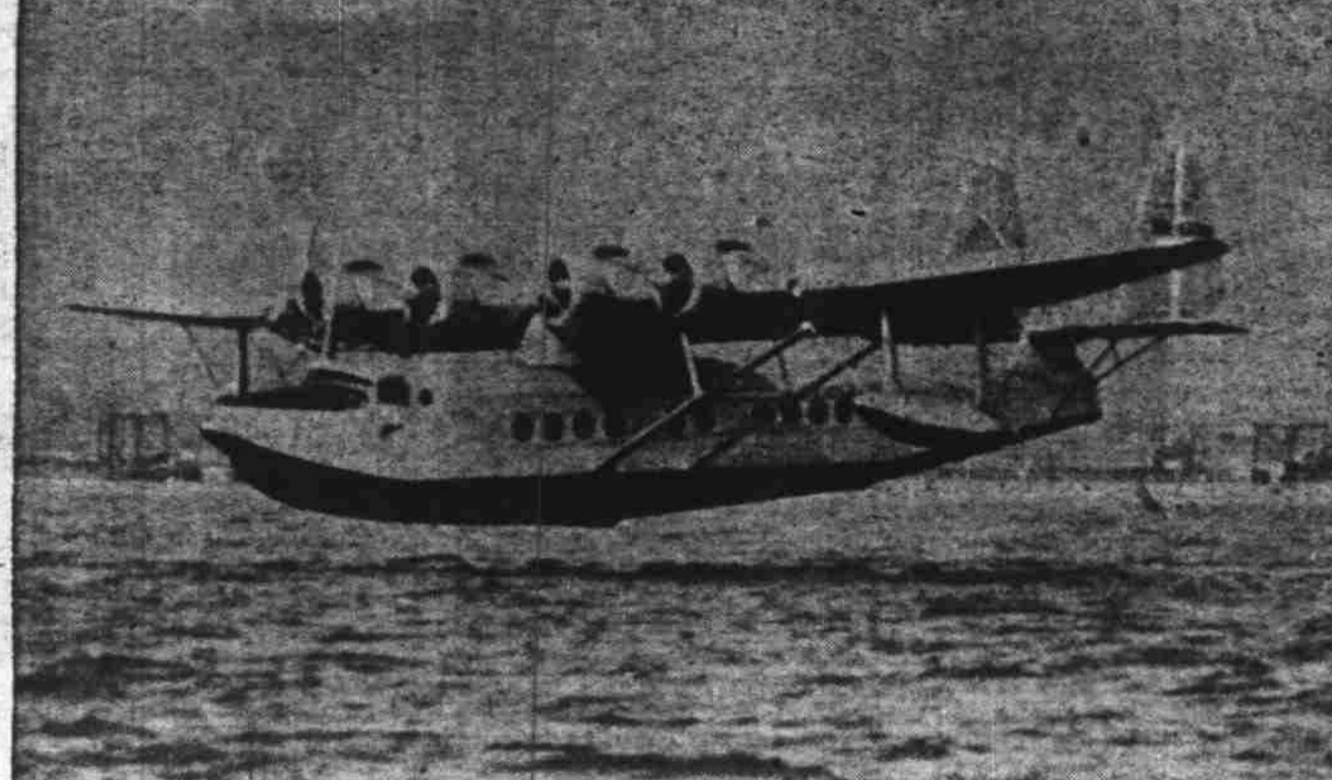
Sought by destroyers and other craft in the Pacific ocean area near the Philippines where it was last reported, the giant Hawaii clipper was still missing early today. Fifteen persons are aboard the big airship, last heard from when it was 500 miles out of Manila Thursday night at 8 o'clock (PST).