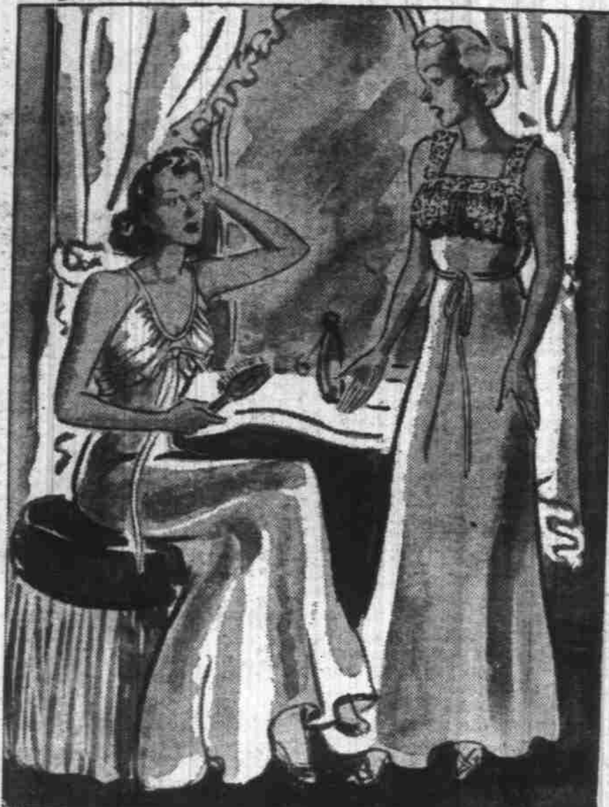
"We had both read the same book on letting the other person do all the talking so you can imagine what happened!"

The trusting little blonde is retiring after a quiet—too quiet—evening, many shades bluer than the soft azure chiffon of her gown.