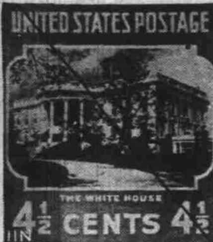
An engraved reproduction of the White House is the distinguishing feature of the new 4 1/2-cent stamp, latest of the series to be issued.