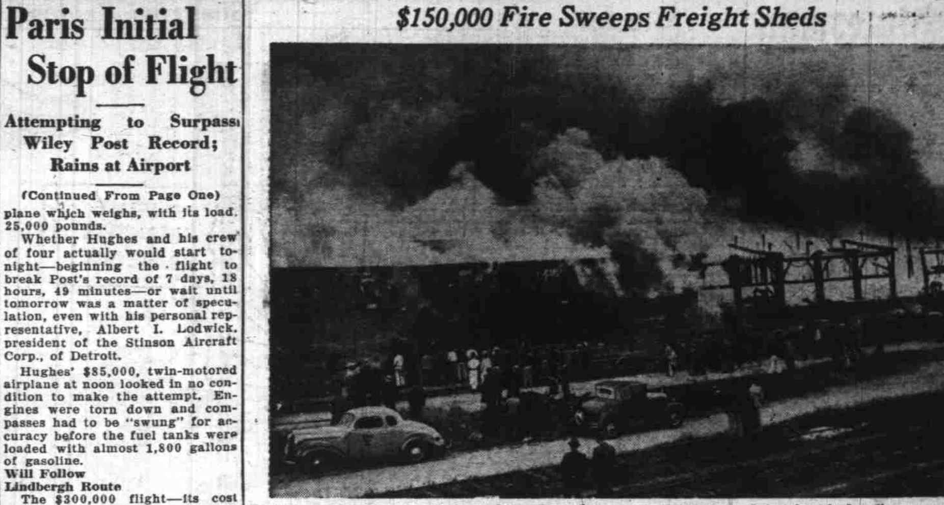
Raging uncontrolled for nearly an hour through more than 500 feet of freight sheds, fire recently brought out every available piece of fire fighting apparatus in downtown San Francisco before it was brought under control. Poison gas, flaring crates of matches and low hanging smoke hampered firemen from driving at the heart of the blaze. A box car of matches exploded, forcing several fire engines to withdraw to save equipment. More than 300 feet of fire hose was consumed by a sudden spread of flames. Photo shows the Southern Pacific freight sheds at the height of the $150,000 fire. Nine firemen were injured .