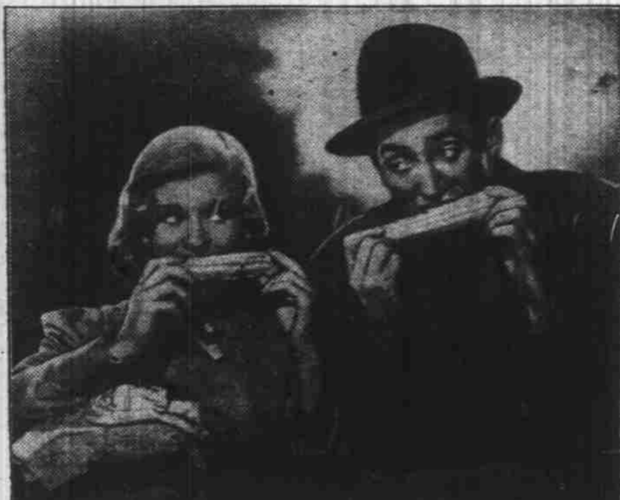
This is not a candid camera shot of a corn-eating contest, but a scene from "Vivacious Lady" in which Ginger Rogers and James Stewart are thus engaged and the featured picture at the Elsinore theatre today.