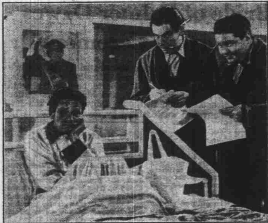
That's what Bazooka Bob Burns would like to know to cure the insomnia which prevents his writing song unconsciously in his sleep which Milton Berle and Jack Oakie pilfer 'mid the gay musicomic festivities in "Radio City Revels" playing today at the Hollywood theatre.

"I am advocating the construction of a big dam in Idaho and another on the Columbia, probably at Umatilla. But, it takes years to build a dam and my greatest concern now is to save off a power shortage. Our power