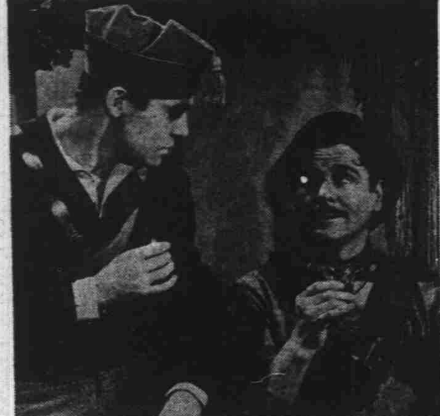
Henry Fonda and Leo Carrillo as buddies in Spain's civil war, which forms the background of "Blockade," a romantic drama opening Wednesday at the Elsinore theatre on a double bill program with "Who Killed Gail Preston" starring Rita Hayworth.