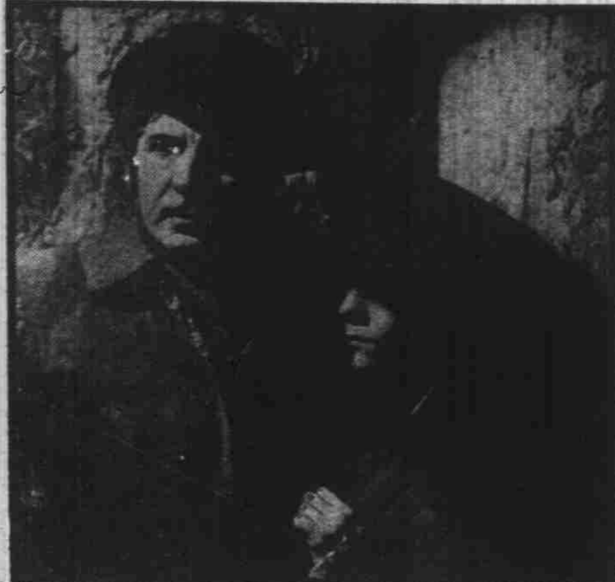
Warner Baxter and Freddie Bartholomew encounter exciting adventure in the 20th Century-Fox production of Robert Louis Stevenson's "Kidnapped" in which they play the leading roles and now showing at the Grand theatre.