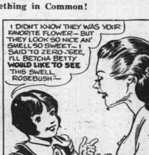
The Girls Have Something in Common!