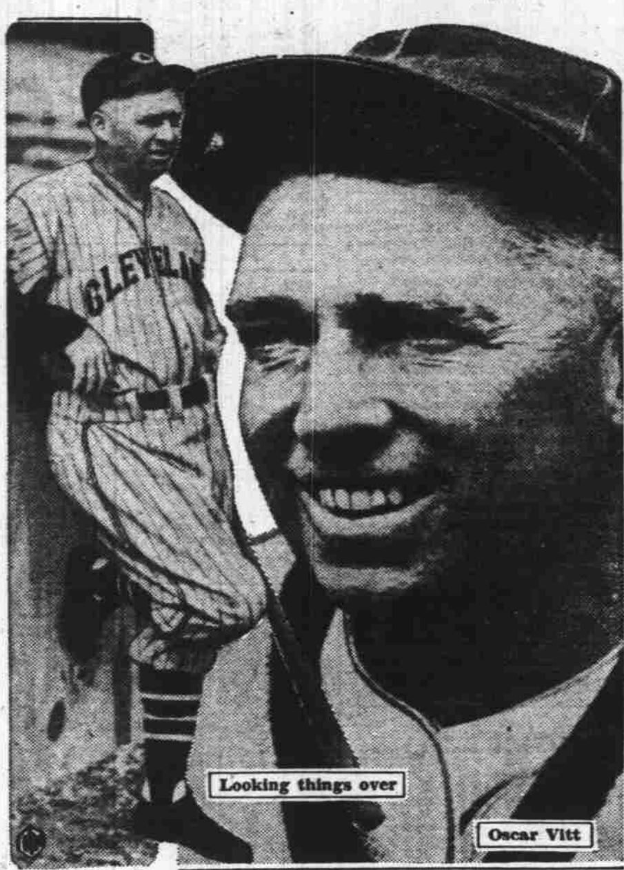
Looking things over