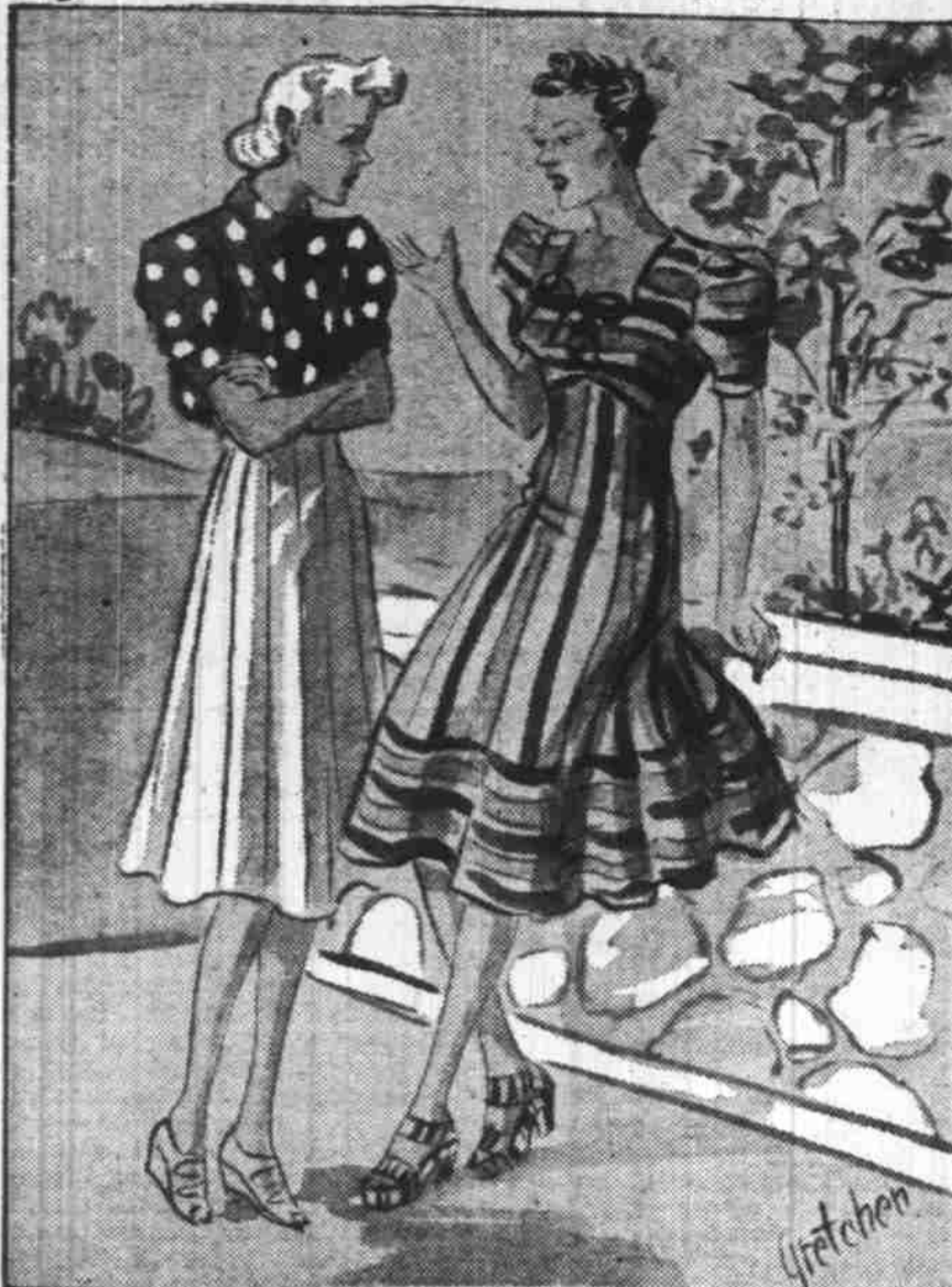
"That's another thing I can't understand about him—he never talks unless he has something to say!"

Well, it takes all kinds... we might wish for less variety in men, but can't have too much in playclothes. Here, certainly, are two contrasts, each with much to say for itself.