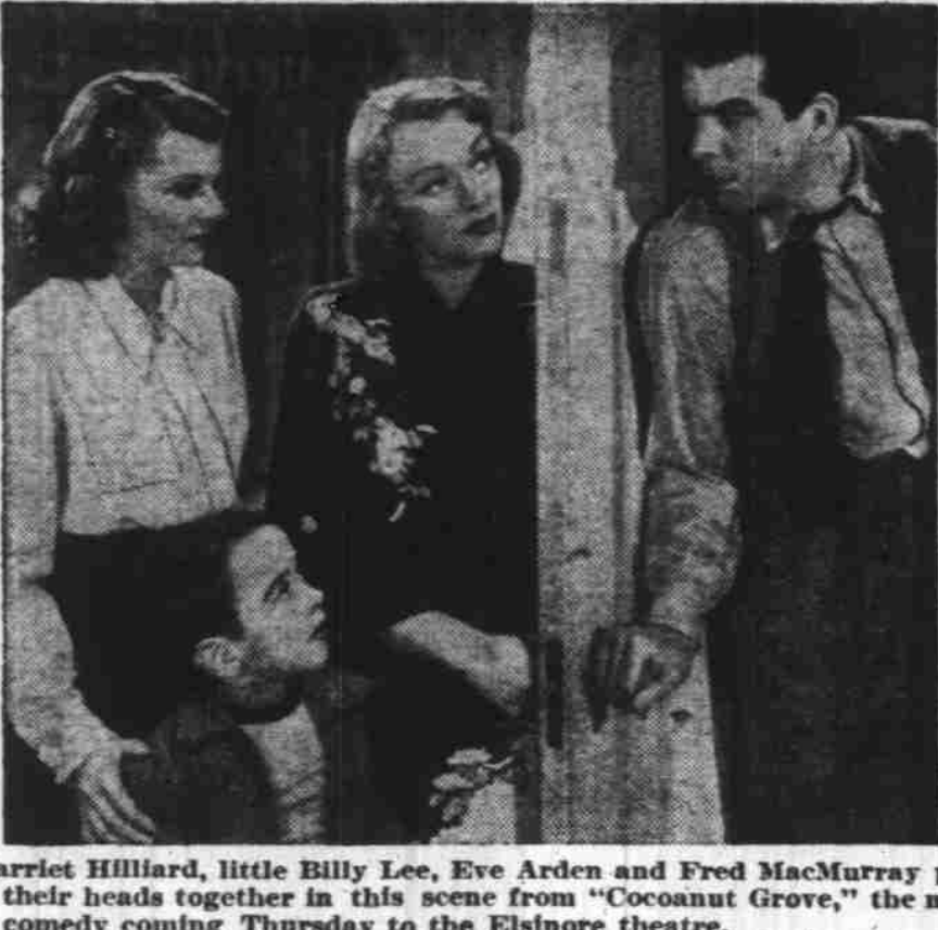
Harriet Hillard, little Billy Lee, Eve Arden and Fred MacMurray put their heads together in this scene from "Cocoanut Grove," the new comedy coming Thursday to the Elsinore theatre.