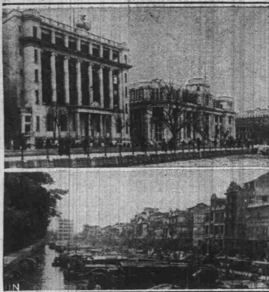
American colony on Hankow waterfront, upper left; houseboats on Shamesen canal in Canton, lower left; map showing war situation, right.