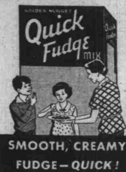
SMOOTH, CREAMY FUDGE—QUICK!