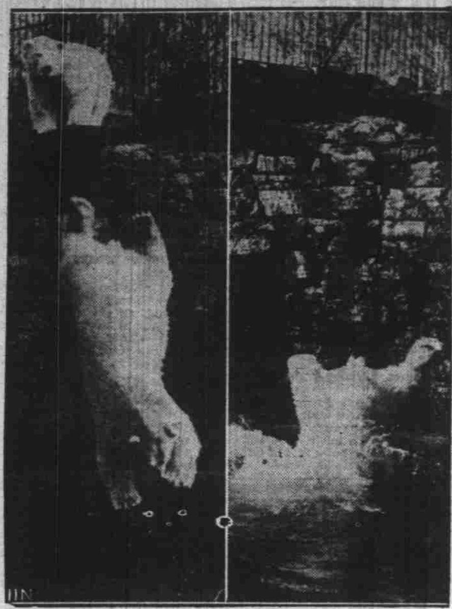
Caesar in midair