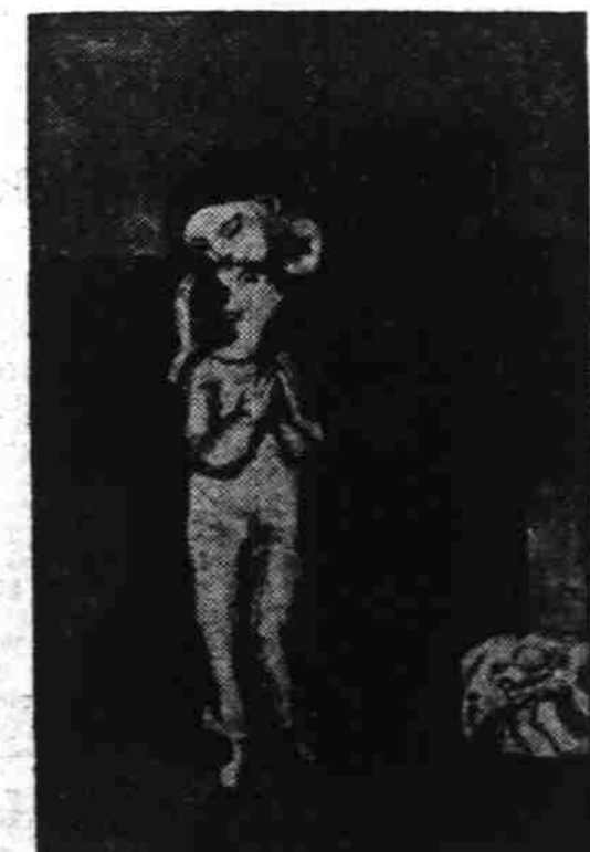
Pinocchio's Motherhood (In Group 11)

This picture is typical of the "Blue Period" of this modern master, who has been called the weathercock of modern art, for every time he changed his style, a thousand imitators changed theirs. He is unquestionably the most influential painter living today. . . . Succeeding the "Blue Period" there was a "Rose Period" and subsequently a "Cubistic Period." Though the last was borrowed from the Cubists he is considered "The Father of Cubism." His untamed restlessness is still casting about for new artistic worlds to explore. . . . He is a best seller in the world's art market.