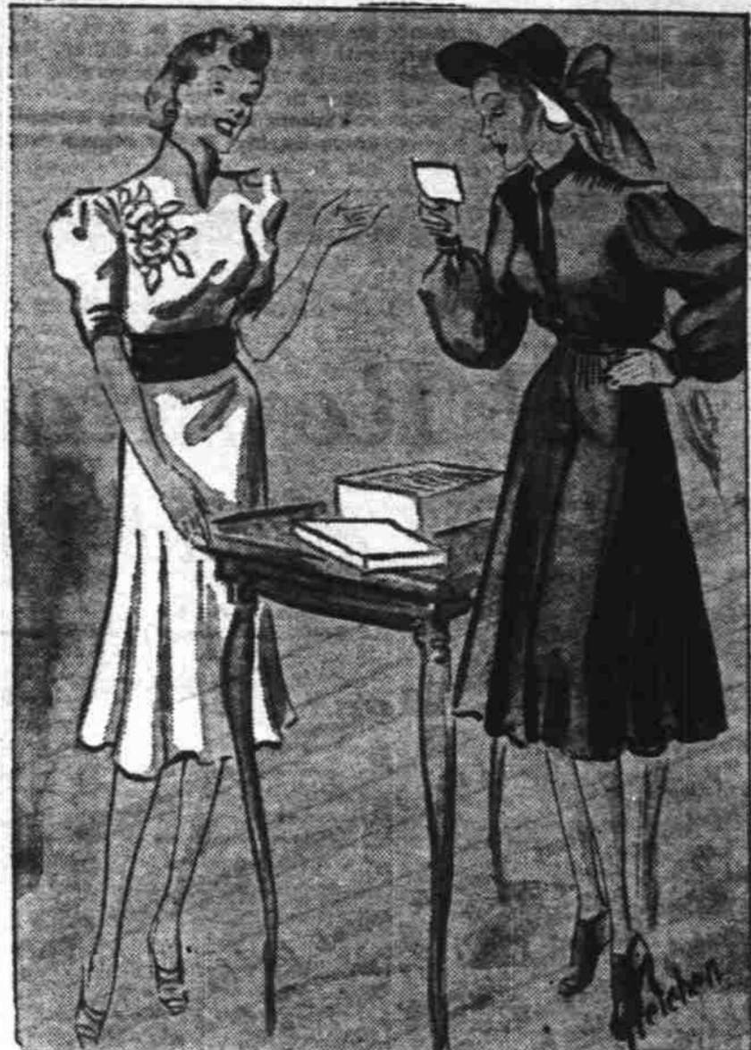
"Can't you just picture everyone's disappointment when they run their fingers over these invitations and find they're really engraved?"

You need no sense of touch when you see her honey-beige frock of sheer wool to know that that expansive flower sprawling over the bodice is really quilted. We like the high notched neckline and crushed brown kid cummerbund, too.