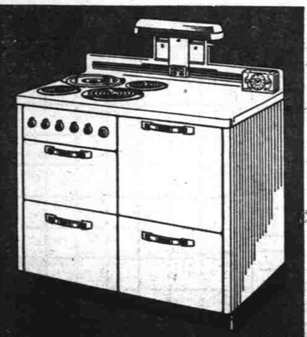
THE SALISBURY—Hotpoint's smart new 1938 built-in electric range with semi-direct lighting, matched condiment set, Select-A-Speed Calrod. Full porcelain enamel.