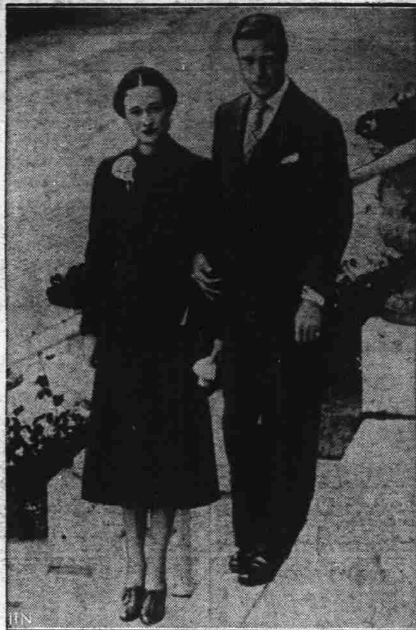
Here is the Duke and Duchess of Windsor as the famous couple appeared at Cap d'Antibes, French resort, where they spent a holiday from social activities at their recently acquired chateau.