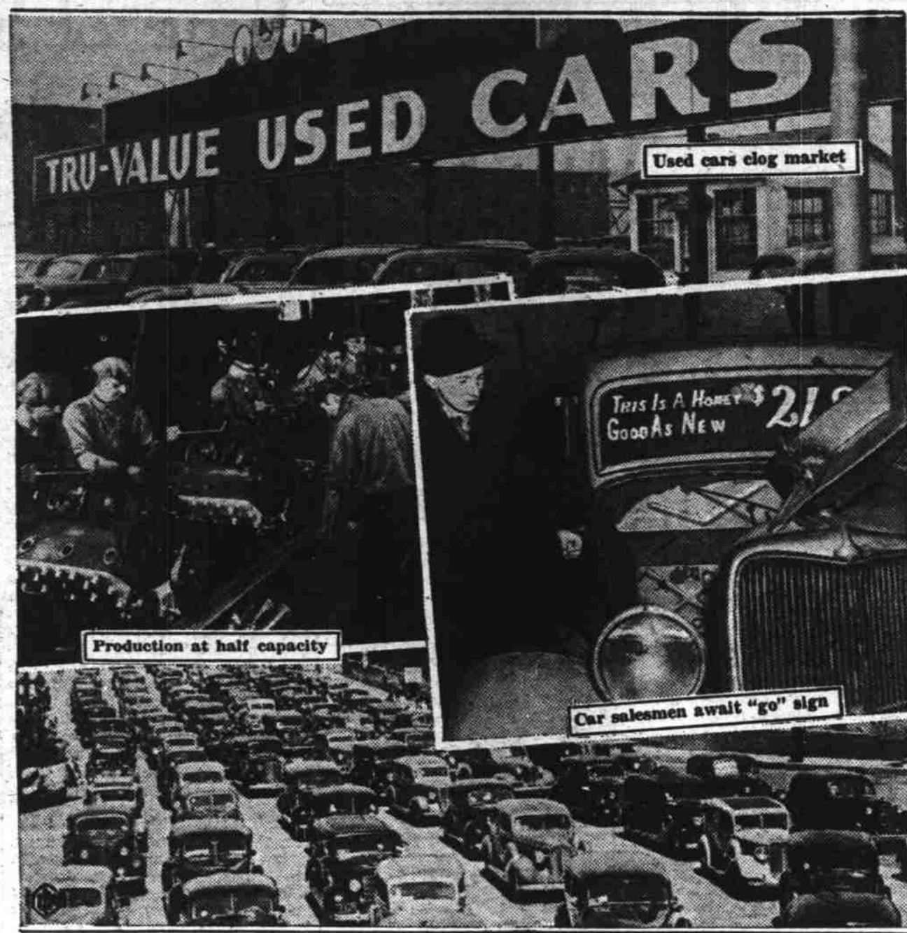
Dismayed by the slump it has suffered during the past two months, the automobile industry is seeking some way out of its dilemma. One factor retarding production has been the excessive number of used cars clogging dealers' agencies. National used car week moved some 175,000 of these and enabled dealers to purchase more new models. Production is now at about 50 per cent of capacity, however, and the total units produced in 1938 is not expected to be much over 3,000,000 in comparison to 5,000,000 built last year, inclusive of trucks and passenger cars.