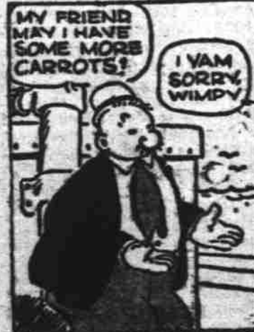
-But Wimpy Has an Unsteady Hand!