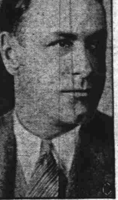
Since 1932 head football coach at Princeton, Fritz Crisler, above, now becomes head coach at Michigan, succeeding Harry Kipke, who was fired.